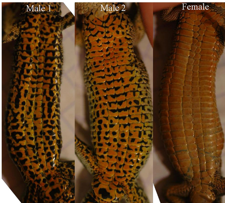
Figure 1. Pictures of the ventrum of two male and one female Zootoca vivipara , demonstrating the extent of the variation in the percentage of ventral melanin-based colouration. This figure is published in colour in the online version.

The reflectance spectra of the lizards were measured with an Avantes spectrometer (AvaSpec-2048-USB2-UA-50 (range 250-1000 nm), Avantes, Eerbeek, The Netherlands). The probe was held perpendicular to the skin surface. The measurements were expressed relative to a white reference tile (WS2, Avantes, Eerbeek, The Netherlands). The lizards' colouration was assessed by measuring the reflectance at thirteen positions: on the head (spot 1); dorsal, between the fore limbs (spot 2); mid-mid on the dorsum (spot 3); mid-lateral (both left and right; spots 4 and 5); lateral (both left